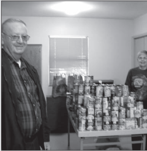
Food pantry volunteers sort through cans of nutritious food at the food bank. Nutritious food is always needed to help feed our community's hungry.