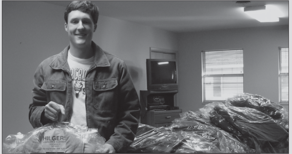
A volunteer sorts through clean coats last December. Coats arrive already cleaned by a local dry cleaners and then given away to anyone who needs a warm winter coat.

Sometimes I find it difficult to say good and positive things about the first months of the year. It's cold and dark and often full of bad weather. But then I stop to think: Valentine's Day is in February, a sweet and lovely break in the month. The days are getting longer, allowing more daylight into our lives. And spring is just one month away! As I reflect on the positives, suddenly, I feel better.